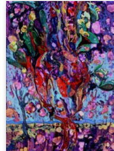
Milagro for the Heart