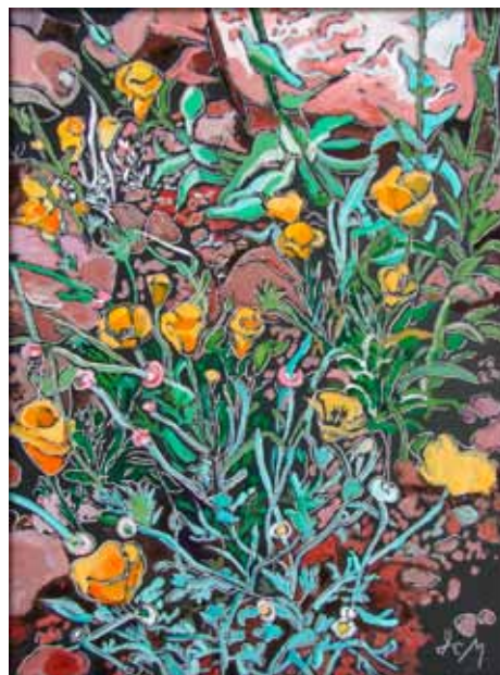
Golden Blooms from the Sonoran

The exhibit continues through December 24 th . See you there!