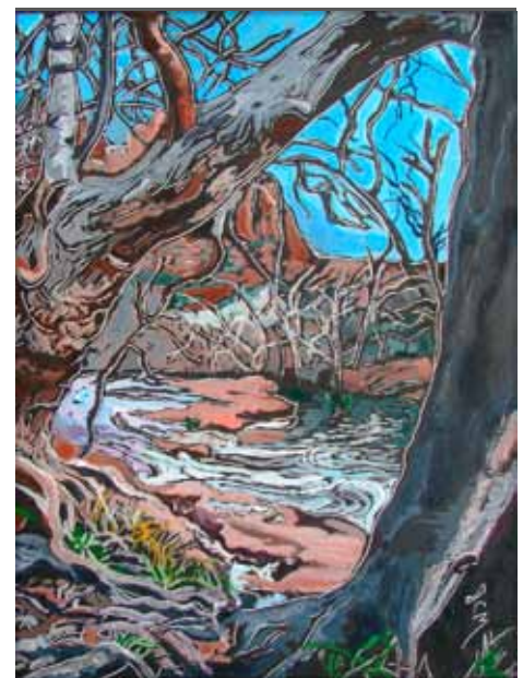
Road to Saguaro Lake